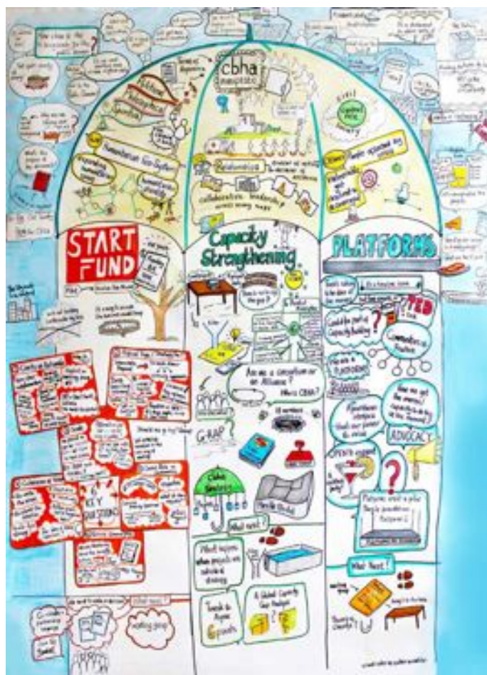
Box 9: Summary of programme plans 45

There are very promising funding discussions about the Start Fund with several governments, including DFID, as well as some non-traditional funders. And it is planned that the Start Fund will evolve into a network of locally governed funds for civil society crisis response – this represents a very significant commitment to new practices in the humanitarian sector.