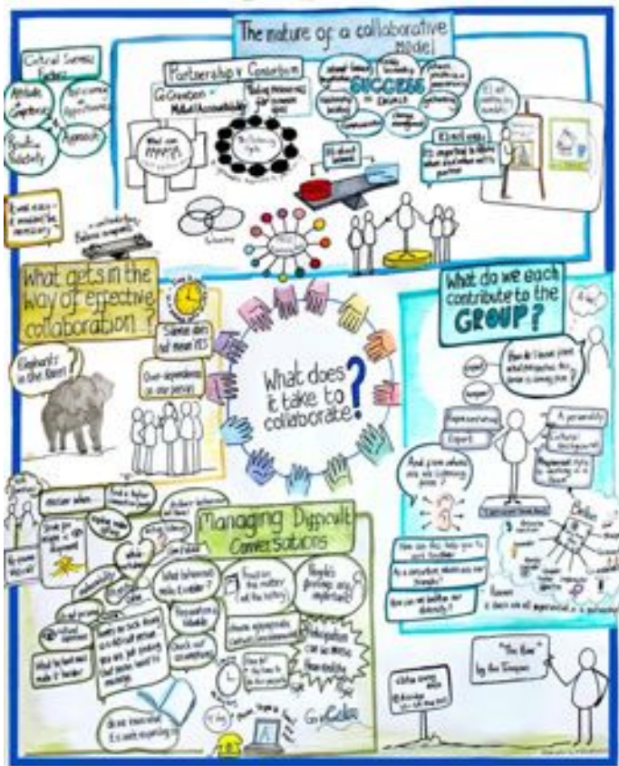
Box 1: Summary of what it takes to collaborate 6

"I didn't operate as a traditional Chair – rather I attempted to strike a good balance between facilitating and leading the Consortium founded in a strong belief in working for the greater good. As a group of Humanitarian Directors, we were naturally very close through our unity of purpose and sense of vocation. But even so, that did not mean it was ever easy – for CBHA to be successful we had to be courageous enough to go into the unknown."