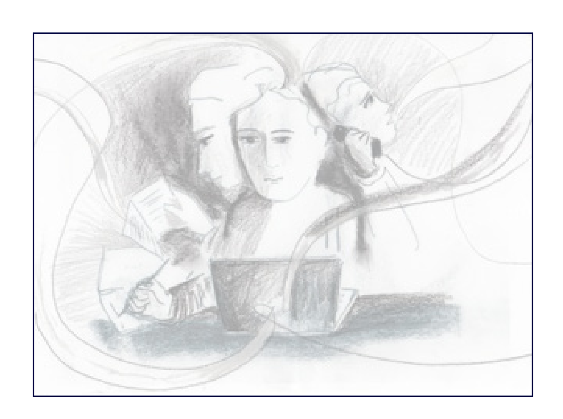
Improving our Learning from Practice An Emerging Case Study Framework for Partnership Brokers