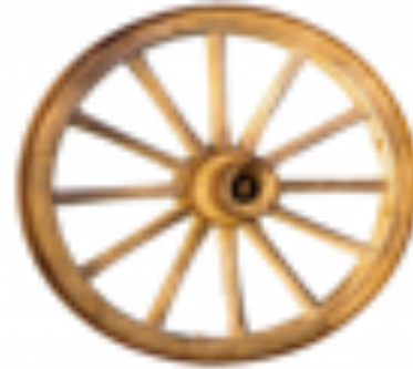
HUB & SPOKES