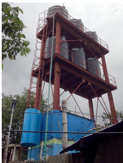
SJP customers are happy to pay for safe water in Dhaka North

The linkage between Marie Stopes and the community in Tongi has a good chance of sustainability, for example, because there are significant benefits to the community in terms of getting higher quality and cheaper services from Marie Stopes than from alternative sources. Because user fees cover the operational costs of the service, there is good alignment between incentives and resources. There is also a close working relationship between partners.