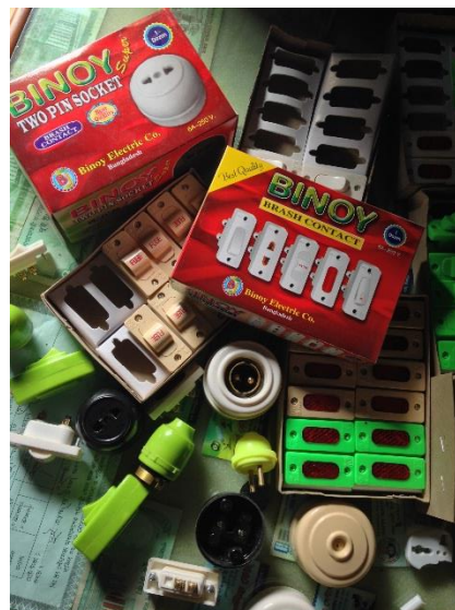
The local CDC helps to find and train all Bijoy Switches' employees

In my review of P&L, I used a qualitative framework to examine these issues. Figure 1.0 has an assessment of the P&L where case studies were prepared for the report, with respect to their chances of sustainability. Each P&L is also placed on a spectrum between having mostly transactional features, and showing strong signs of being very collaborative.