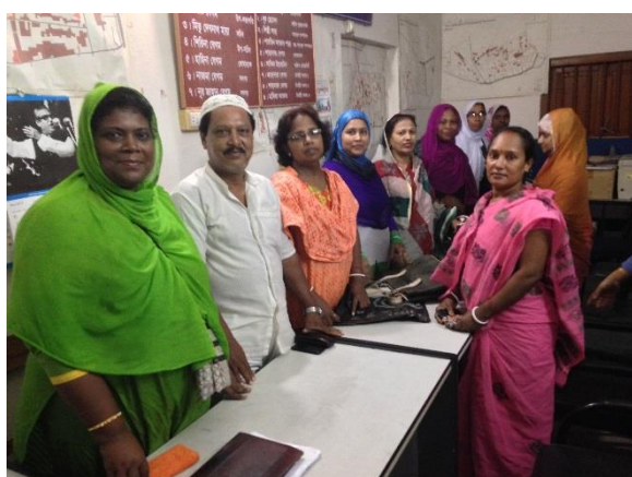
Cluster leaders come together in a town-level Federation

UPPR was a UK Aid funded partnership between the Local Government Engineering Department, UNDP and UN-Habitat. Its primary goal was to lift households in poor urban settlements out of poverty. This large and ambitious project had recognized that poverty is multidimensional in nature, and required the delivery of an integrated response with complementary interventions. Since 2008, it has supported over 2,500 poor urban communities in 23 towns and cities across Bangladesh.