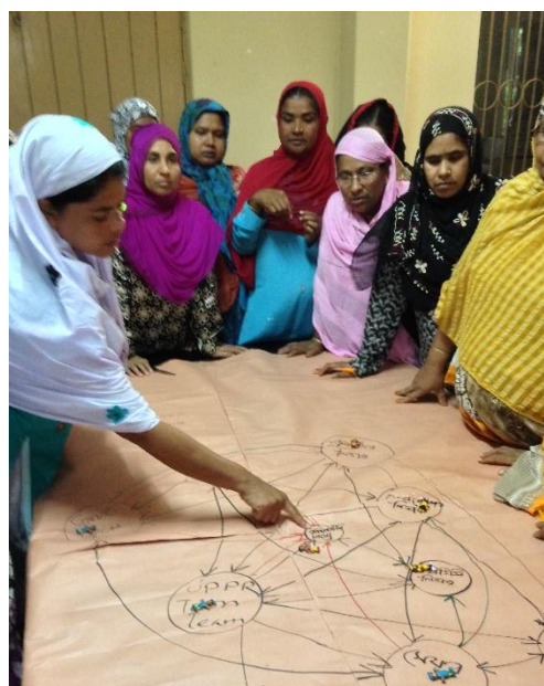
A network mapping exercise revealed the brokering role played by UPPR staff

There is evidence that UPPR Town teams have adopted this style of leadership. For example in a workshop with community members in Sarajganj, the group almost overlooked the fact that the UPPR team communicates with NGOs providing health services in P&L, whereas the reality is that UPPR had been the prime mover in setting them up. For community members, this aspect of UPPR’s role may be much less visible than other parts of the programme, which is well appreciated when we see the high power and influence scoring given to the UPPR Town team in the same exercise.