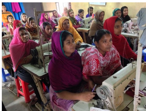
Community members want better health and education services but they also want jobs

My first finding was that the use of P&L by UPPR allows adaptive programming. This flexible and needs-driven approach is in step with recent development thinking, as captured in the ‘doing development differently’ agenda. This is a movement being led by research organizations, funders and practitioners following a meeting in late 2014. 4 A comparison between this agenda and the P&L programme suggests strong similarities in several areas: for instance, the focus on solving local problems identified by local people; the use of conveners to mobilize communities and other stakeholders so that ‘top down’ solutions are not imposed; and being flexible and experimental in trying a number of ideas and then building on the successful ones.