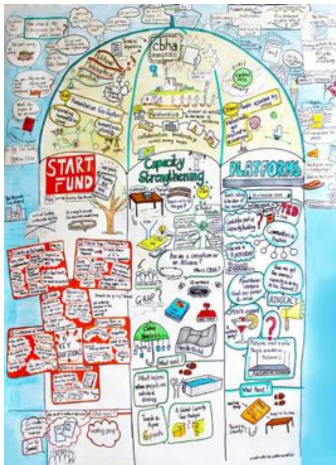
Box 9: Summary of programme plans 45

There are very promising funding discussions about the Start Fund with several governments, including DFID, as well as some non-traditional funders. And it is planned that the Start Fund will evolve into a network of locally governed funds for civil society crisis response – this represents a very significant commitment to new practices in the humanitarian sector.